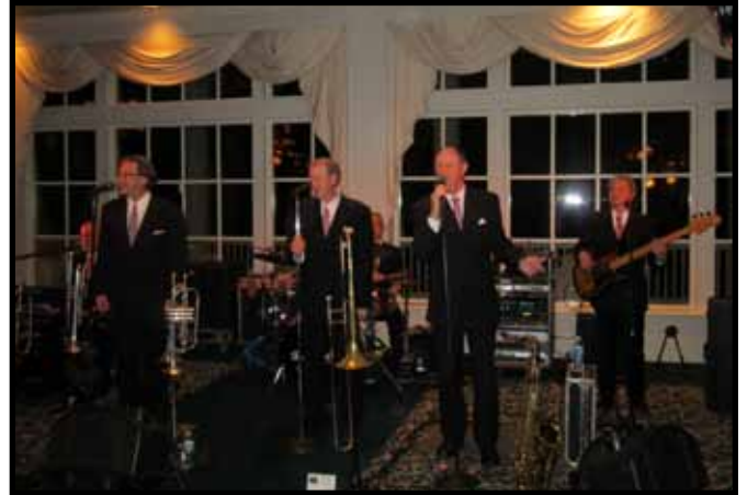
The HEADLINERS played until midnight. DIYC members stayed until the last song was finished!