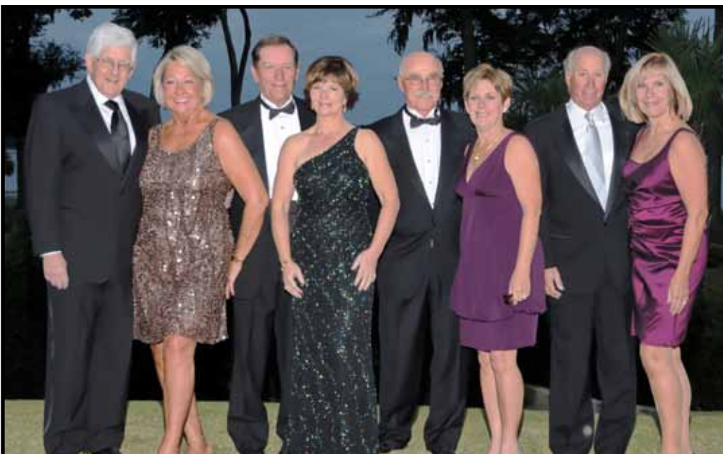
The 2011 Social Committee – the people responsible for another wonderful Commodore’s Ball!